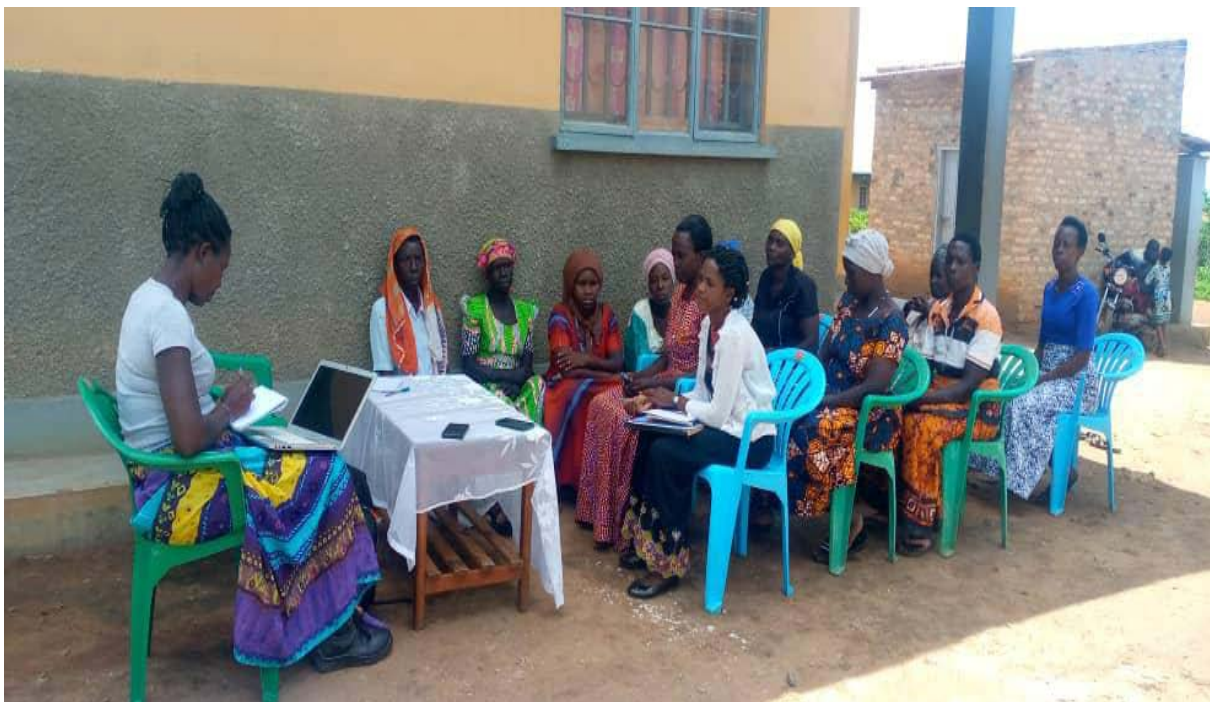
Some of the research participants during a Focus Group Discussion (FGD)

Key words: Beekeeping; Honey production, Forest restoration, Resettlement camps, Green economy